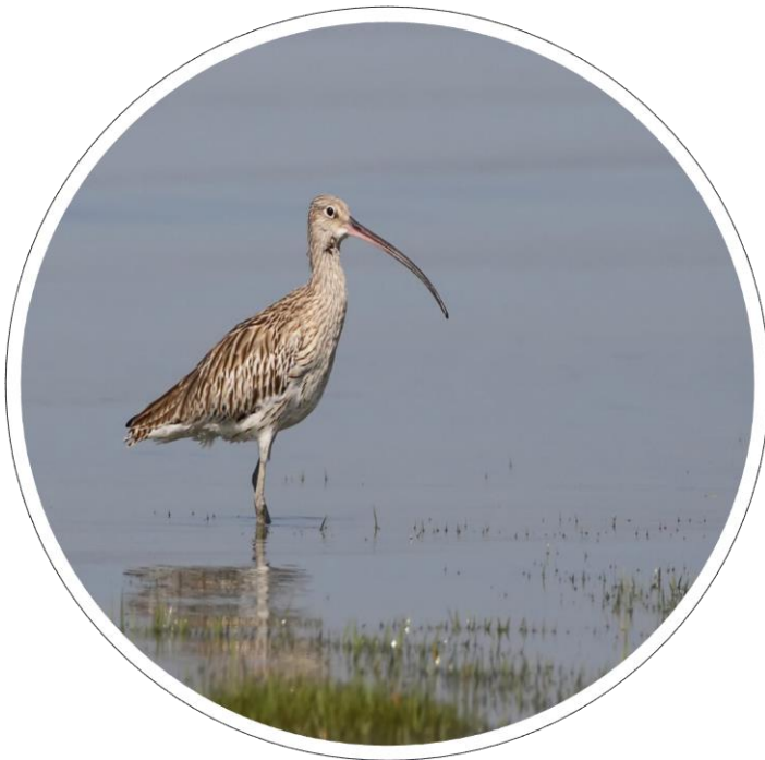
Eurasian Curlew (Numenius Arquata)