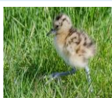
Curlew chick

Very sadly the Curlew is becoming an endangered bird and we hope you will support us to help it recover by raising awareness of this beautiful bird and entering our competition.